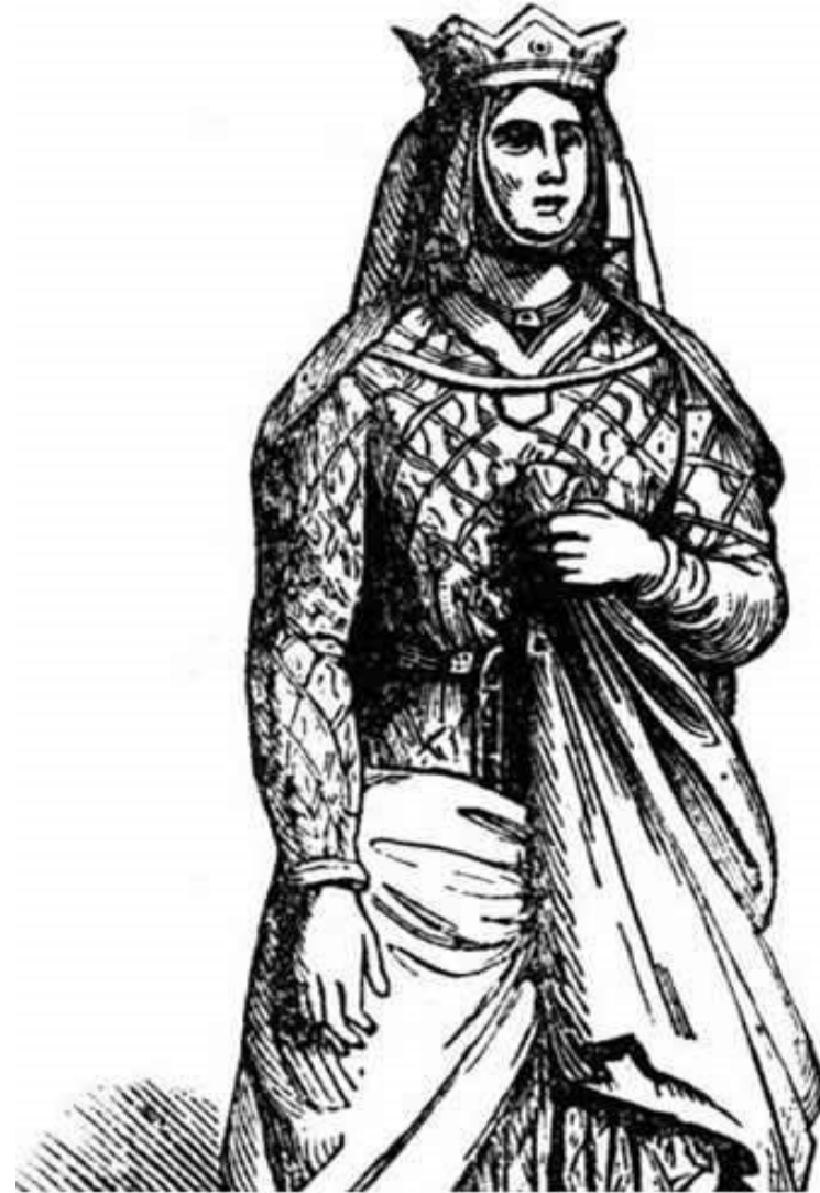
Eleanor of Aquitaine